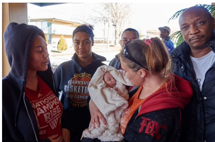
It wasn't far from our minds that Jesus was born in a place an awful lot like America's Best